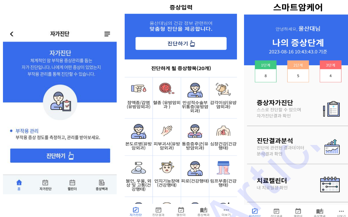
Fig. 2. List of symptoms (or variables) for self-diagnosis and presentation of the results.